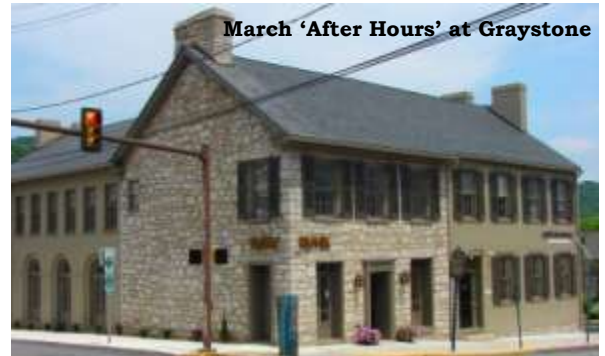
March 'After Hours' at Graystone

Downtown Bedford, Inc. was established in 2002. Since then, DBI has been a PA Main Street program, and in 2009 was accredited as a National Main Street program for its many successful efforts. Downtown Bedford, Inc. is a constant promoter of special events, business recruitment & retention, and historic preservation. DBI's façade program has distributed over $150,000 to local businesses towards upgrading the fronts of their buildings, which has made an overwhelming difference in the appearance of downtown. DBI's newest project is a streetscape to be under construction this summer. This will provide new coordinating sidewalks & pedestrian lighting for parts of Juliana, Pitt and Richard Streets. The engraved brick sales are a way for the community to exude their pride in downtown, which it turn enhances tourism as well.