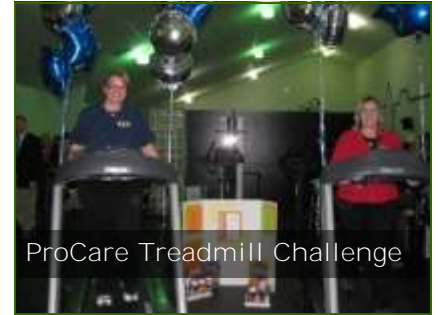
ProCare Treadmill Challenge

ProCare plans to match the donations made at the event and hopes to present a check to the food bank for over $1,000.00. To learn more about Pro Care facilities in Bedford County, visit: www. ProCareFitness.com