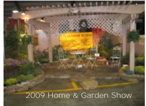
2009 Home & Garden Show