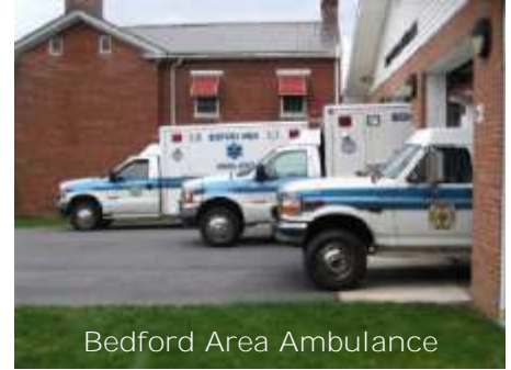
Bedford Area Ambulance